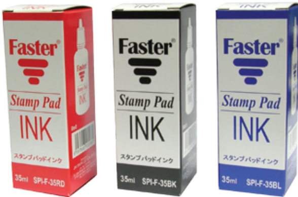
BOX OF 1 PC