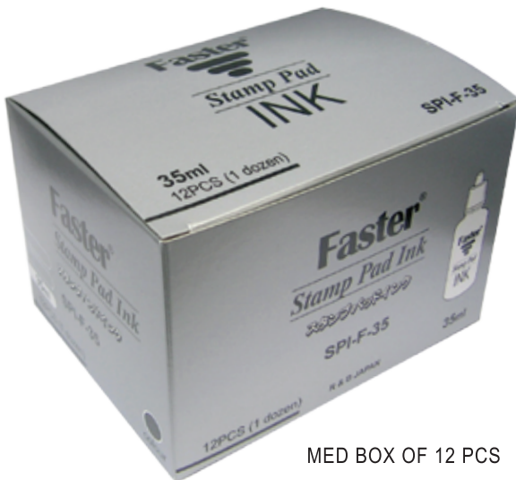
MED BOX OF 12 PCS