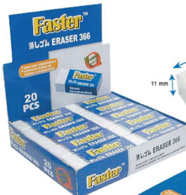
BOX OF 20 PCS