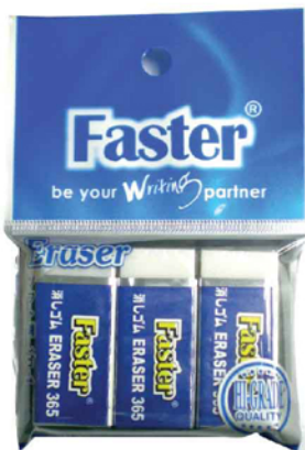
PACK OF 3 PCS