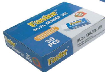
BOX OF 30 PCS