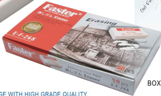
BOX OF 50 PCS