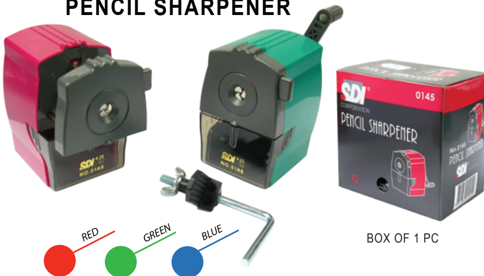
BOX OF 1 PC