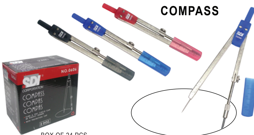
BOX OF 24 PCS